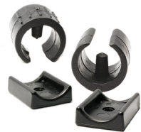
Saddle feet and bases.

Call us on 01634 686504 or visit our website at www.sinclair-rush.co.uk