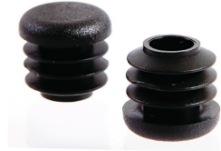
Internal, Round Push-in Chair Feet