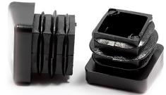
Square, angled internal-fitting feet