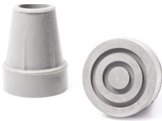
Larger Rubber Feet for lab stools/frames.