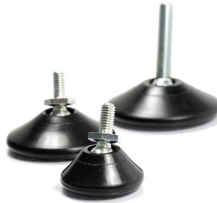
Height Adjustable & Tilt Screw on Feet