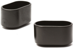
Oval plastic foot ideal for oval table legs.