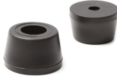
Screw on Rubber Feet, also used as Buffers.