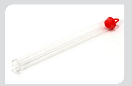
Permaseal tubes with hanger plugs