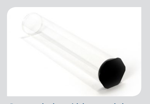
Permaseal tubes with hexagonal plugs