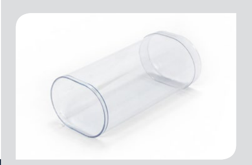
Oval clear tube