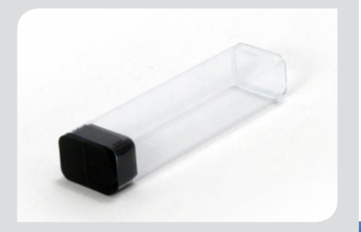
Rectangular clear tubes