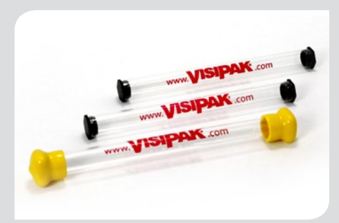
Round clear tubes