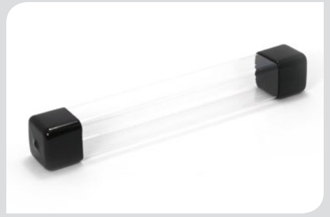
Square clear tubes