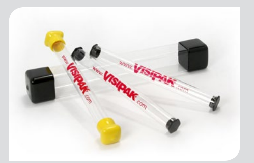
Printed clear tubes