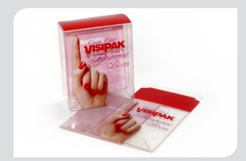
Clear folding boxes

They are ideal for keeping items safe in storage or by post and perfect for point of sale (POS) display.